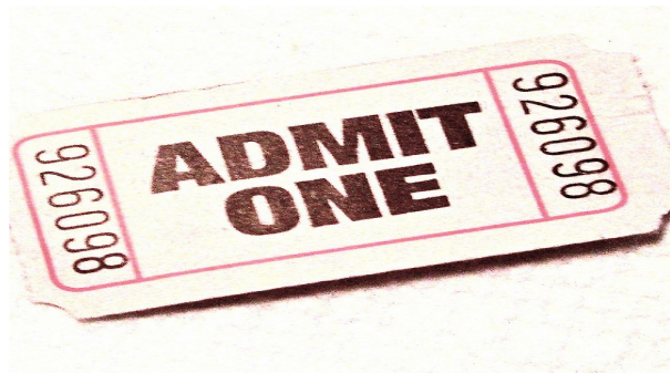
Photo Shoot Information

No ticket sales at the theater box office.